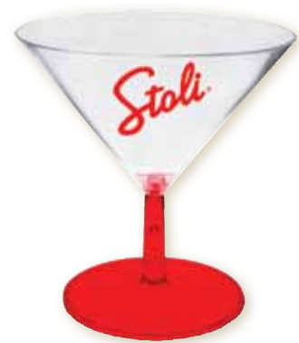
3oz Martini: MT300 Material: Styrene Product Size: 3.25" w x 3.5" h Imprint Area: 1.5" w x 1" h Pack Out: 100 • Size: 14" x 14" x 14" Weight: 5 lbs