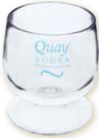
2oz Brandy: B200 Material: Styrene Product Size: 2" w x 2.25" h Imprint Area: 1.125" w x .75" h Pack Out: 100 • Size: 11" x 11" x 11" Weight: 9 lbs