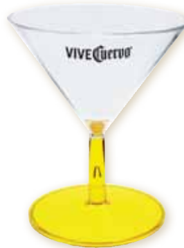
2oz Martini: MT200 Material: Styrene Product Size: 2.75" w x 3.375" h Imprint Area: 1" w x 1" h Pack Out: 100 • Size: 14" x 14" x 14" Weight: 5 lbs