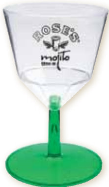
2oz Wine: W200 Material: Styrene Product Size: 2.25" w x 4" h Imprint Area: 1" w x 1" h Pack Out: 100 • Size: 14" x 14" x 14" Weight: 6 lbs