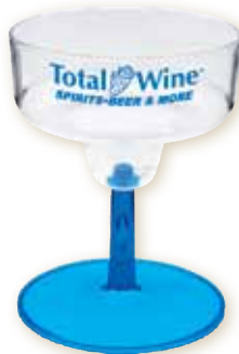
2oz Margarita: MG200 Material: Styrene Product Size: 2.25" w x 3.375" h Imprint Area: 2" w x .5" h Pack Out: 100 • Size: 14" x 14" x 14" Weight: 6 lbs