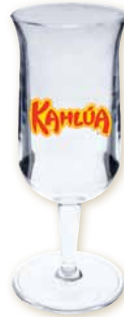
2oz Hurricane: H200 Material: Styrene Product Size: 1.875" w x 4.5" h Imprint Area: 1.25" w x 1" h Pack Out: 100 • Size: 14" x 14" x 14" Weight: 9 lbs