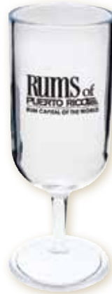
2oz Champagne: C200 Material: Styrene Product Size: 1.6" w x 4" h Imprint Area: 1.0625" w x 1" h Pack Out: 200 • Size: 17" x 17" x 8" Weight: 10 lbs