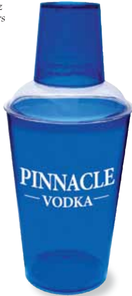
12oz Shaker Colors