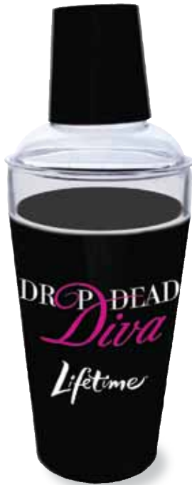
16oz & 20oz Shaker Colors